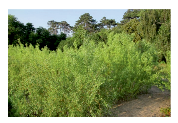
Photo 4. Efficiency of "Bio-gel" on perennial tree crops

It is also confirmed by field experiments on different crops, including forest crops with the chemical fungicides of different producers. Experiments showed that the use of half-dose of chemical fungicides together with "Bio-gel" provides practically the same result, as the dose, which is recommended by producers. Thus was proved the rather