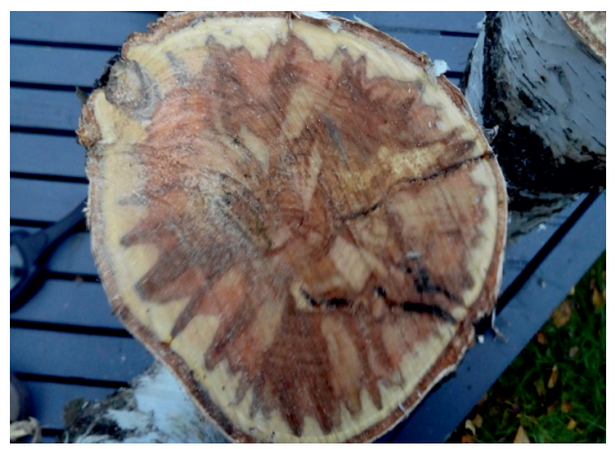
Photo 3. Damages of woody by phytopathogenic bacterium Erwinia multivora Scz.-Parf [11]

Carriers of bacterial disease are woodpeckers, who make openings in the trunk of birch and drink juice in the spring, and also such insects pests – birch bark beetle, birch ship-timber beetle.