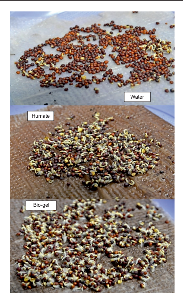
Photo 5. Influence of the products of humate of the chemical origin and "Bio-gel" on the test crop – rape seed

high efficiency of new product in the process of biological activity of agro-industrial production.