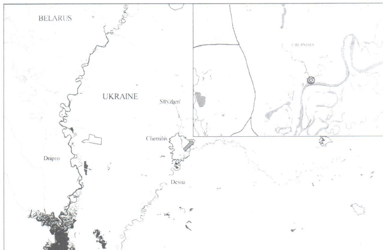
Figure 1. The study area: location of alluvial sediment (round sign)