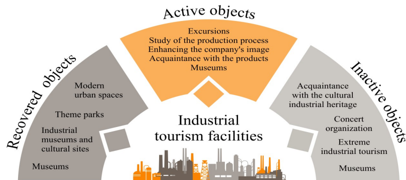
Figure 2. Objects of industrial tourism (developed by the authors based on [5; 7; 8; 9])

The marketing strategy for the development of industrial tourism is aimed not only at the development of the enterprise. Since industrial tourism, in one way or another, involves related industries and seeks to develop the competitive advantages of the entire region.