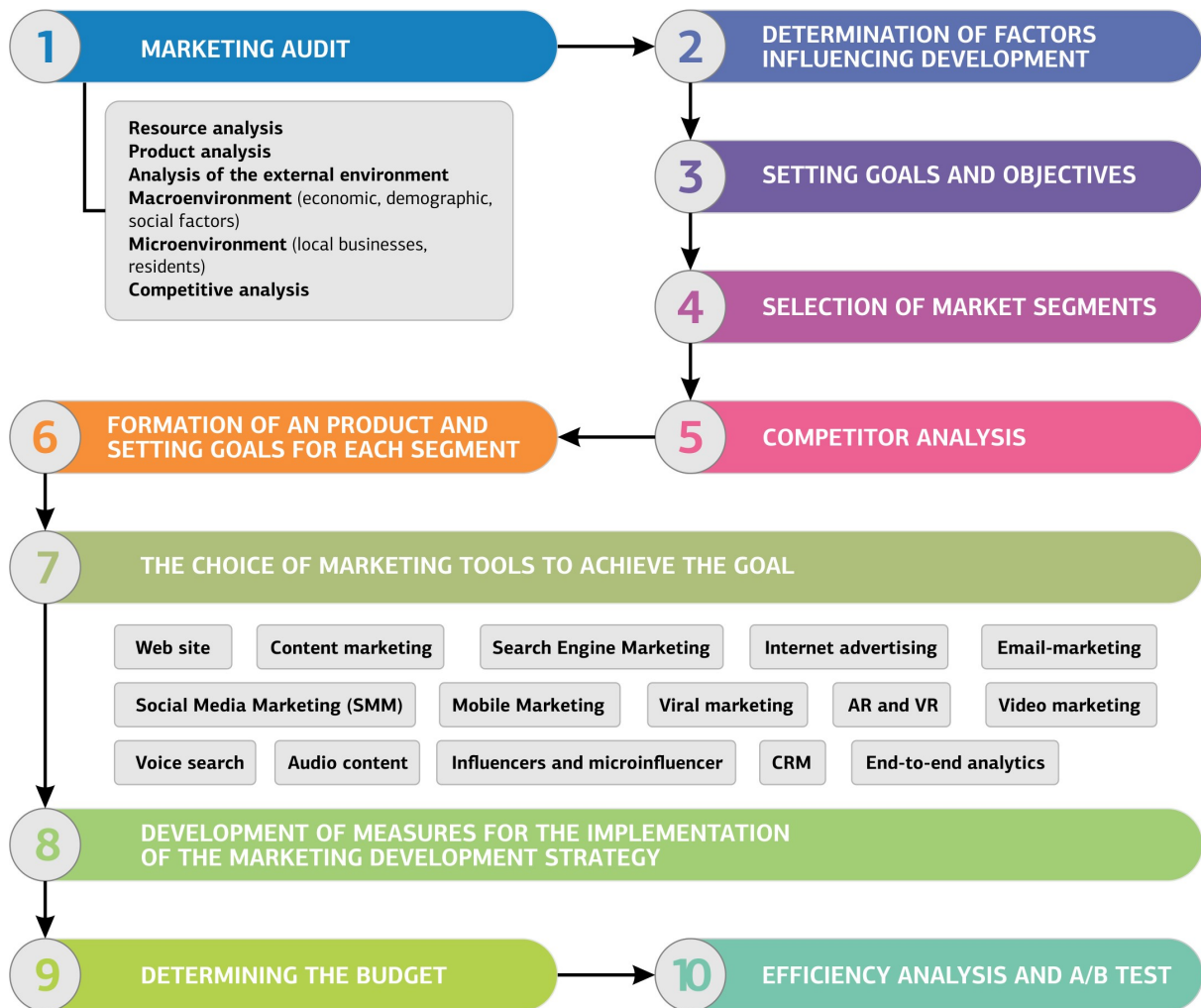
Figure 3: Methodology for determining a marketing strategy using web technologies (developed by the authors)

For a marketing strategy for the development of industrial tourism, three advantages of Internet marketing are significant, which distinguish it from the classic: